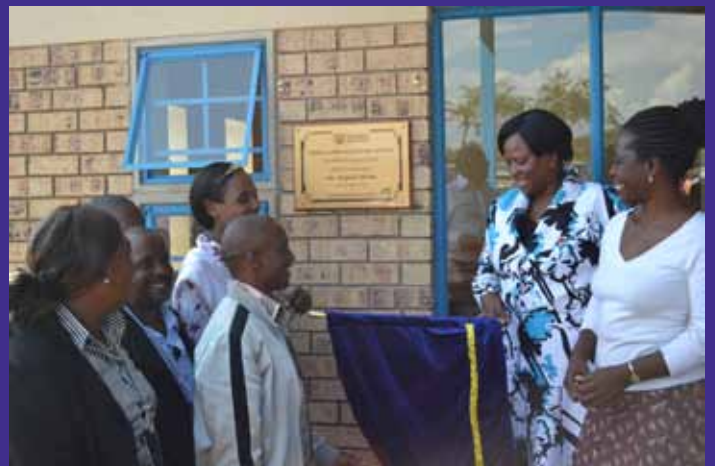
Cyril Clarke Secondary School