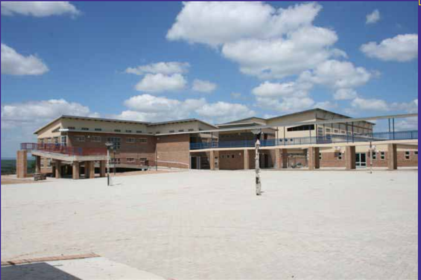
Nhanyane Secondary School