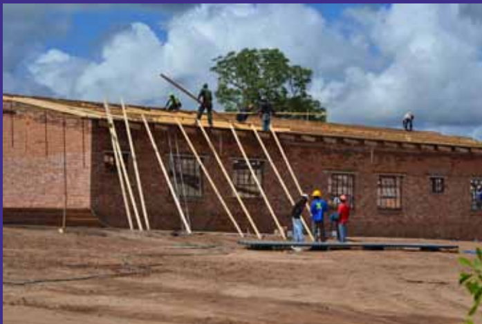
KaMhlushwa Primary School