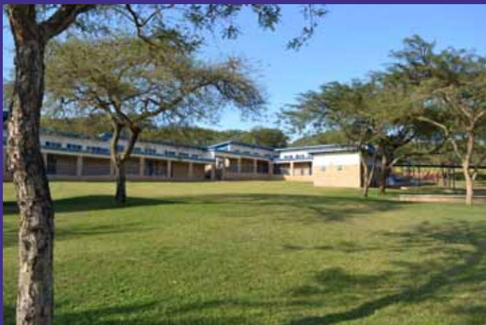
John Mdluli Primary School