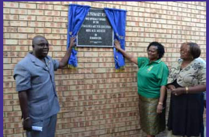
Lamlile Primary School